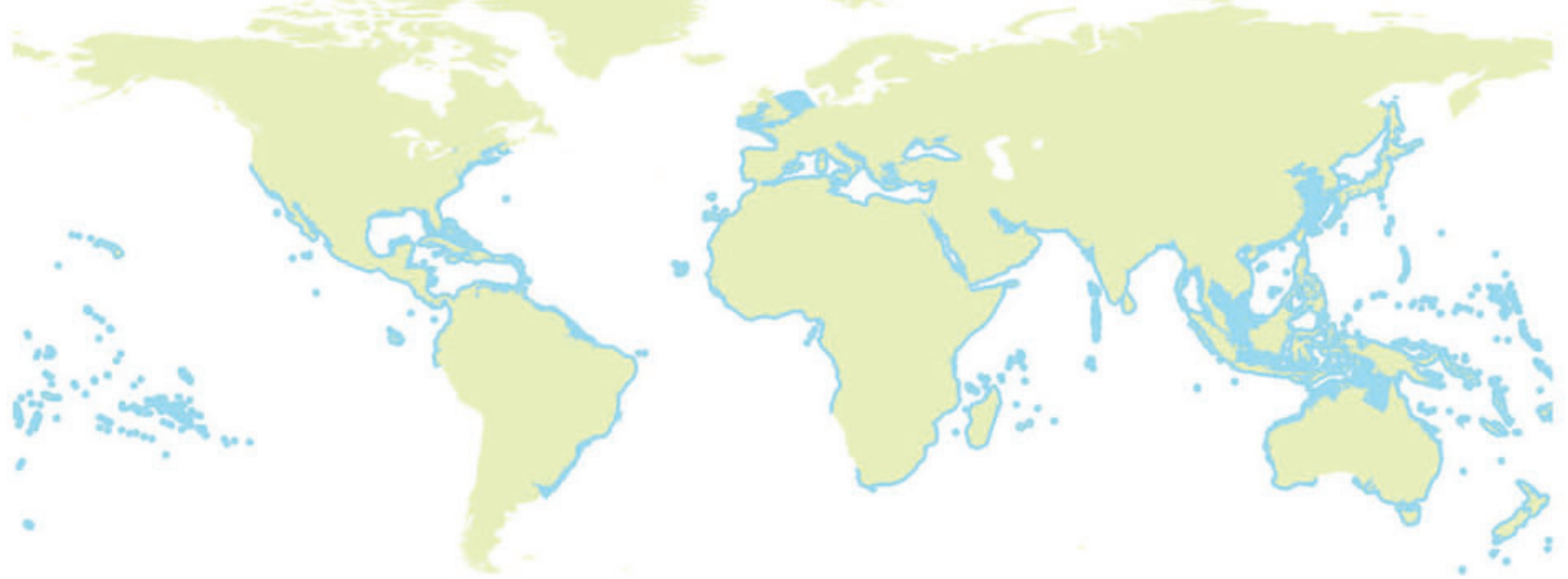
Blue shading shows where seahorses are found.

The opportunity is to advance effective in-the-ocean conservation that is durable and responsive to local needs. National staff have a long-term commitment to the country and its marine heritage. They can work effectively with government agencies, colleagues and compatriots on legislation, policy and action relating to conservation of biodiversity. They are also best placed to help national authorities build in-country capacity to meet regional and global obligations. Further, national staff can act as catalysts for national marine conservation activities, by building networks among key stakeholders with a shared mission toward a sustainable ocean future.